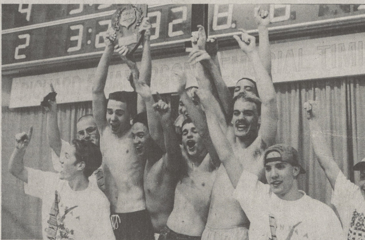
Members of the Kings Mountain High boys swim team proudly display the championship trophy after successfully defending their state title in Friday's 1-A/2-A/3-A meet at Koury Natatorium in Chapel Hill.

In girls action, Kings Mountain placed 12th out of 63 teams. It was the second straight 12th place finish for the Lady Mountaineers. Angela Bunzel placed in the top three in two events and the girls posted their best times of the season in all of their events but were