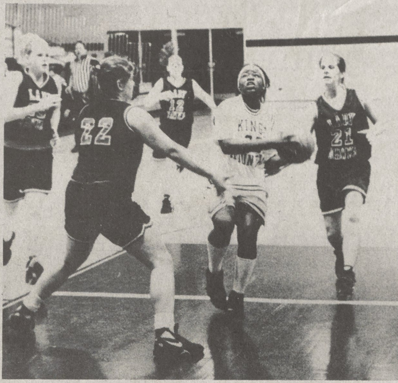
with North Buncombe at the KMHS gym. The Lady Mountaineers lost 48-29, ending their season with a 17-10 record.