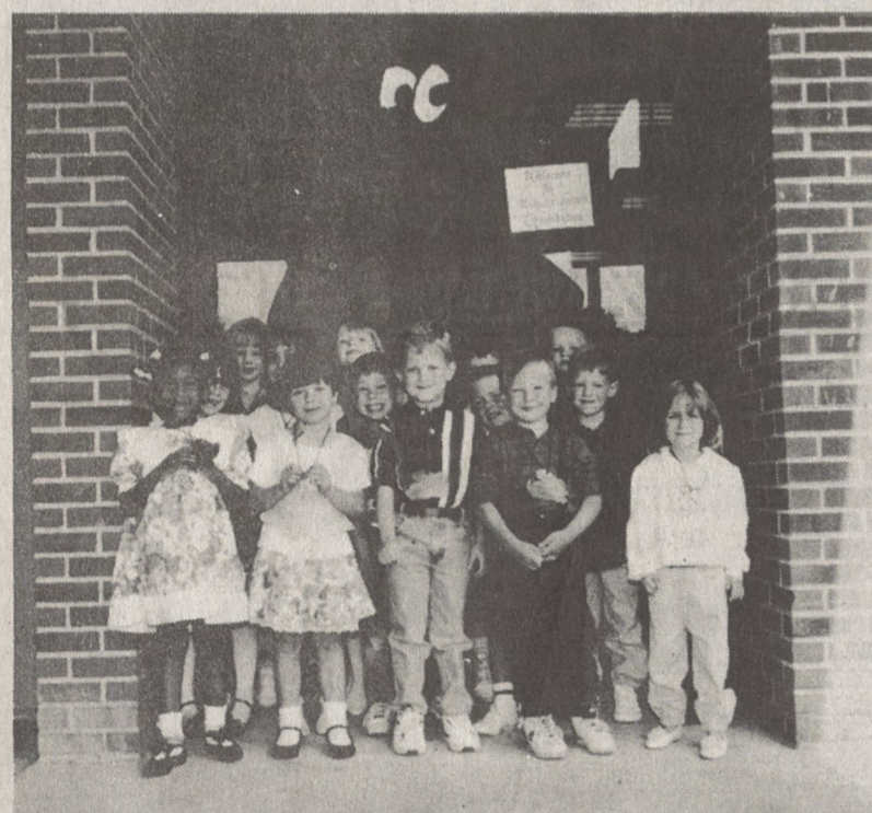
KINDERGARTEN ORIENTATION - Here are some of the 84 children who attended orientation for 1994-95 kindergarten classes at Grover School.