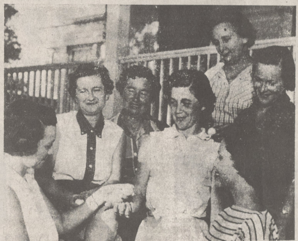
WOMEN GOLFERS HOLD TOURNAMENT — Women Golfers of the Foothills League gathered in Gastonia last week for a tournament at Gaston Country Club. Pictured are five of the members of the league which includes members from Shelby, Gastonia, Kings Mountain, Lenoir, Mooresville, Catawba, Statesville, Morganton, North Wilkesboro, and Lincolnton. Up front are