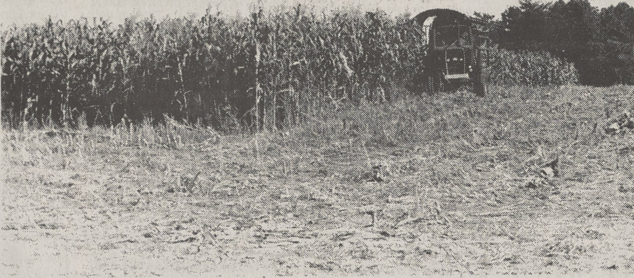
The good rains of the summer will mean good eating for Wayne Yarbrow's cattle this winter. Yarbrow is pictured above cutting a huge field of corn off Margrace Road near Kings Mountain. The corn is now stored in Yarbrow's silo and fermenting for winter use.