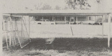
Aluminum Carports Double $1595 Installed

100% Financing Available • No Down Payment • FREE Estimates