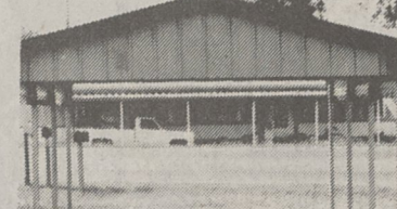
Single Carport Sale Price $1,000