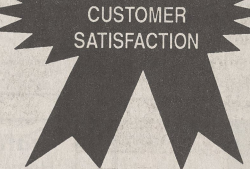
STOP BY & TAKE ADVANTAGE OF OUR SERVICE COUPON SPECIALS & MEET OUR PROFESSIONAL SERVICE STAFF!!