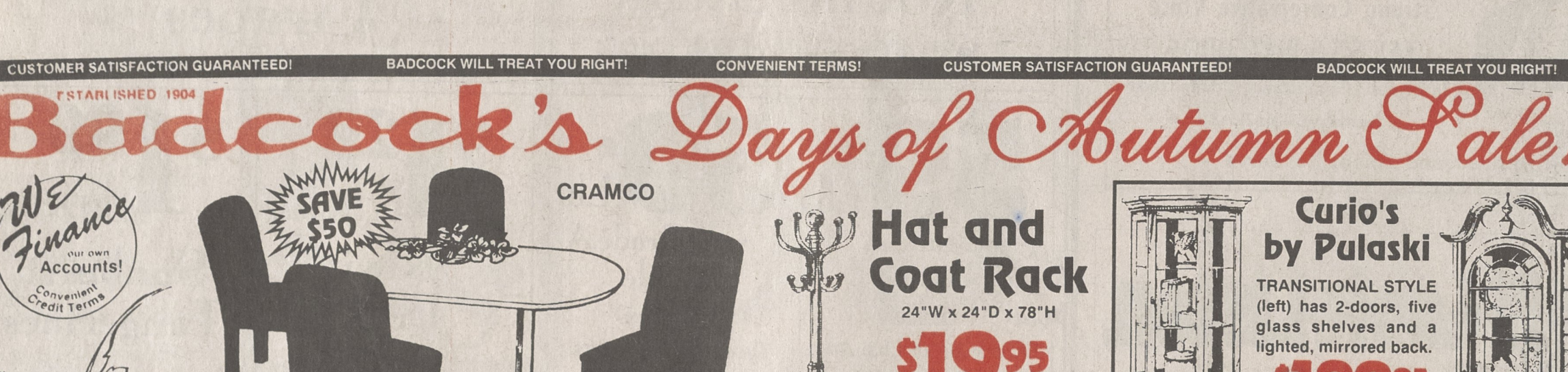
Table has high-pressure plastic protective top (47OT) ... $129.95 Chairs have upholstered backs seats & legs (47PC) $80.00 each