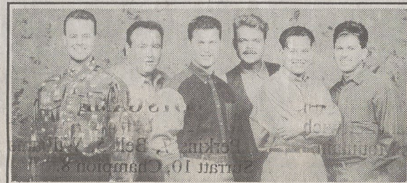
SEVEN formerly The Regals