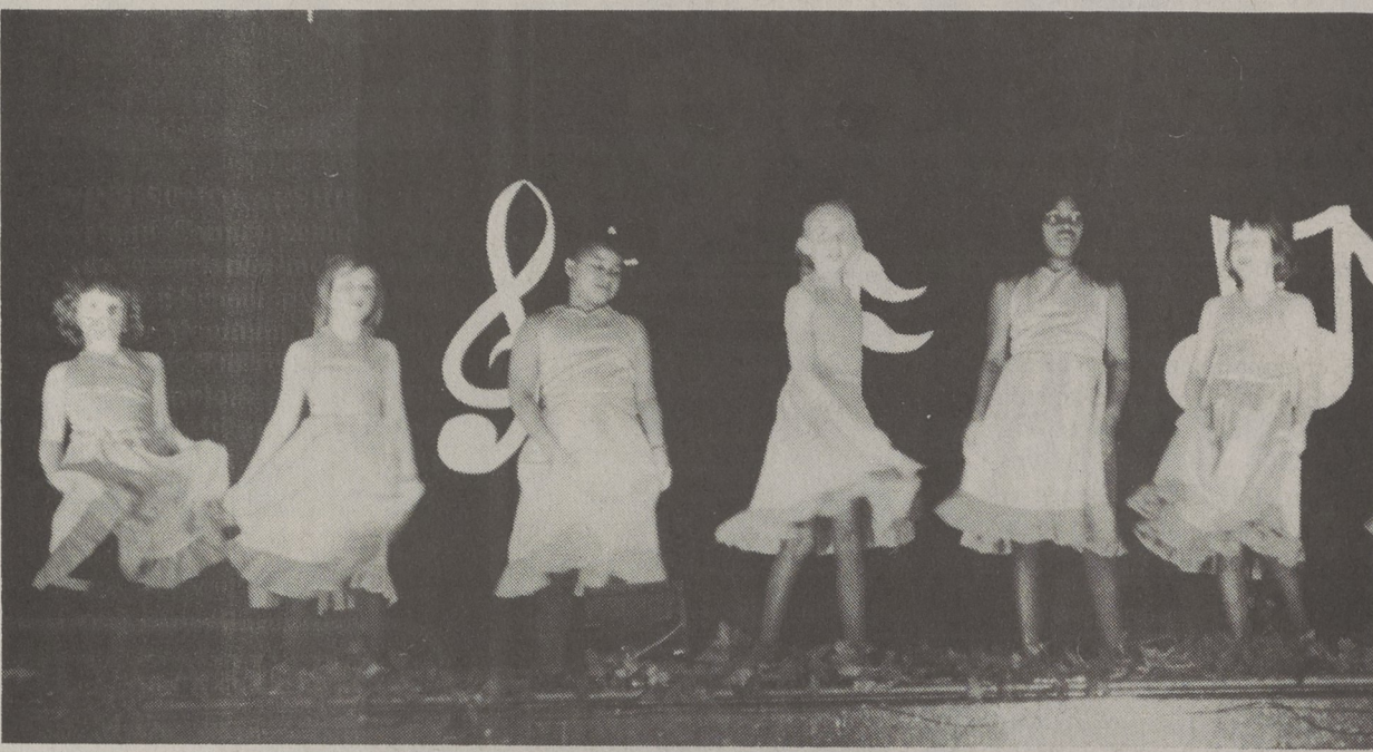
Students from Washington Elementary School perform patriotic musical