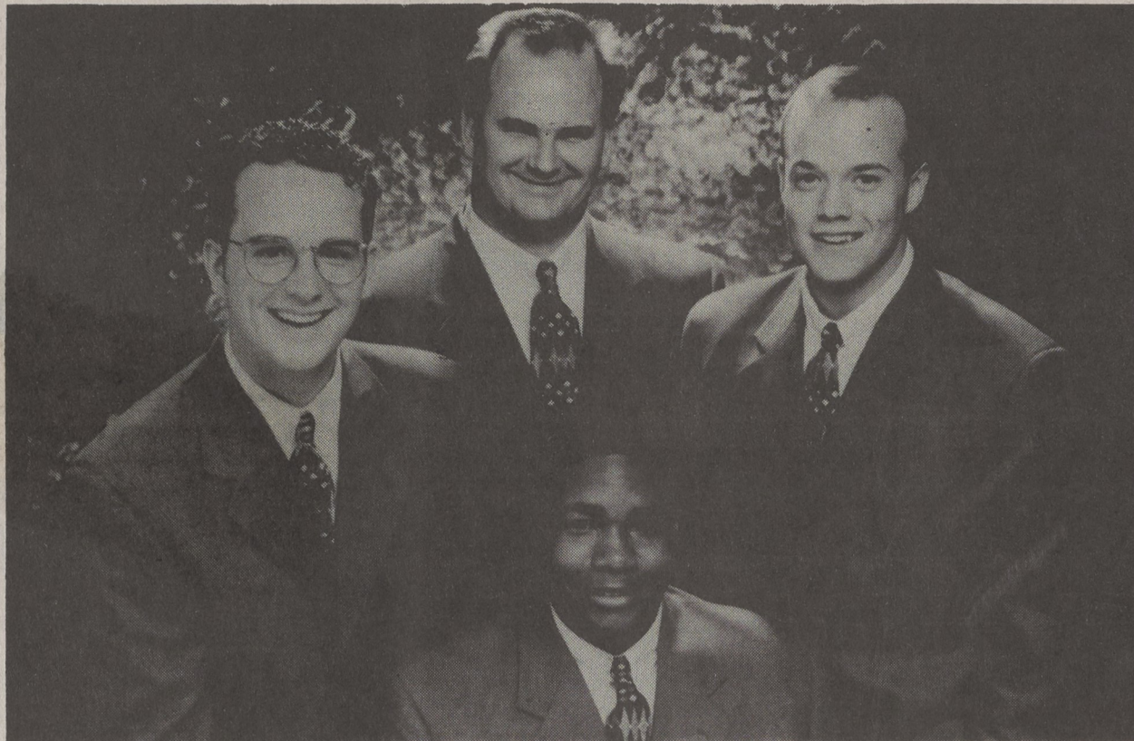
The Trevadores, above, will present a concert Sunday at 6 p.m. at Kings Mountain Church of the Nazarene on Cherokee Street.

Memorials may be made to Oakview Baptist Church, P.O. Box 1517, Kings Mountain, NC 28086, or to the charity of the donor's choice.