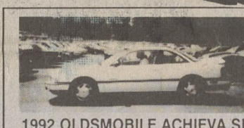
1992 OLDSMOBILE ACHIEVA SL