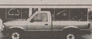
1994 MAZDA B2300

25TH ANNIVERSARY EDITION Auto, Air Cond., AM/FM Stereo Cass $11,598 or 270. 15 Per Mo. 598 Down & Tax, Tag, Financing, 11,000 54 Mos. 12.75 APR