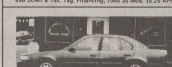
1993 NISSAN MAXIMA GXE

Auto, A/C, Low Miles, X-Clean $13,598. 00 or 285. 24 Per Mo.