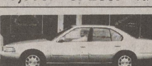
1994 NISSAN MAXIMA GXE

Auto, Air Cond., Pwr. Pkg., One Owner $14,998. 00