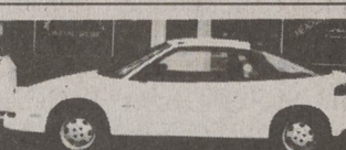
1990 GEO STORM

Auto, Air Cond., Cass. $7998 or 187. 79 Per Mo. 998 Down & Tax, Tag, Financing, 7,000 48 Mos. 13% APR