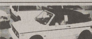
1992 V.W. CABRIOLET

Power Roof, Power Locks, Power Windows, Loaded $7698 or 282. 09 Per Mo. 698 Down & Tax, Tag, Financing, 7,000 30 Mos. 15.25 APR