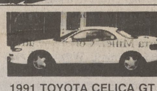
1991 TOYOTA CELICA GT

A/C, Pwr. Pkg., Tilt, Cassette $9998 or 271. 56 Per Mo. 998 Down & Tax, Tag, Financing, 9,000 42 Mos. 13.5 APR