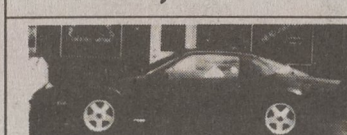
1993 CHEVROLET CAMARO RS

Auto, Air Cond., Pwr. Pkg., 14,000 Miles, One Owner $17,498. 00