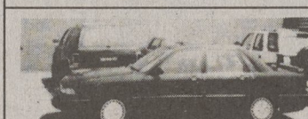
1989 MITSUBISHI GALANT GS

Air Cond., Cass., Power Steering & Brakes $6598 or 207. 25 Per Mo. 598 Down & Tax, Tag, Financing, 6,000 36 Mos. 14.75 APR