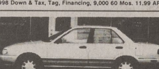
1994 NISSAN SENTRA XE

Auto, Air Cond., Pwr. Pkg., One Owner $14,998 or 299. 47 Per Mo. 1598 Down & Tax, Tag, Financing, 13,400 60 Mos. 11.99 APR