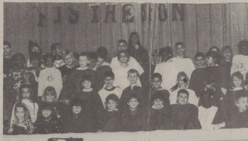
HOLIDAY PROGRAM - More than 100 students in Kids Etc. presented a Christmas gala December 19 at Barnes Auditorium. The program was a Christmas gift to the parents from the children.