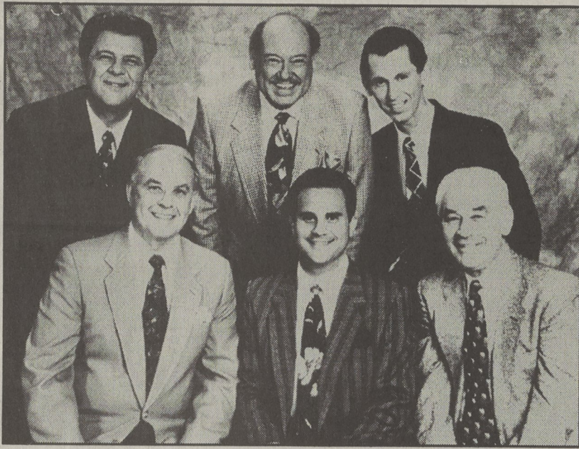
The Florida Boys