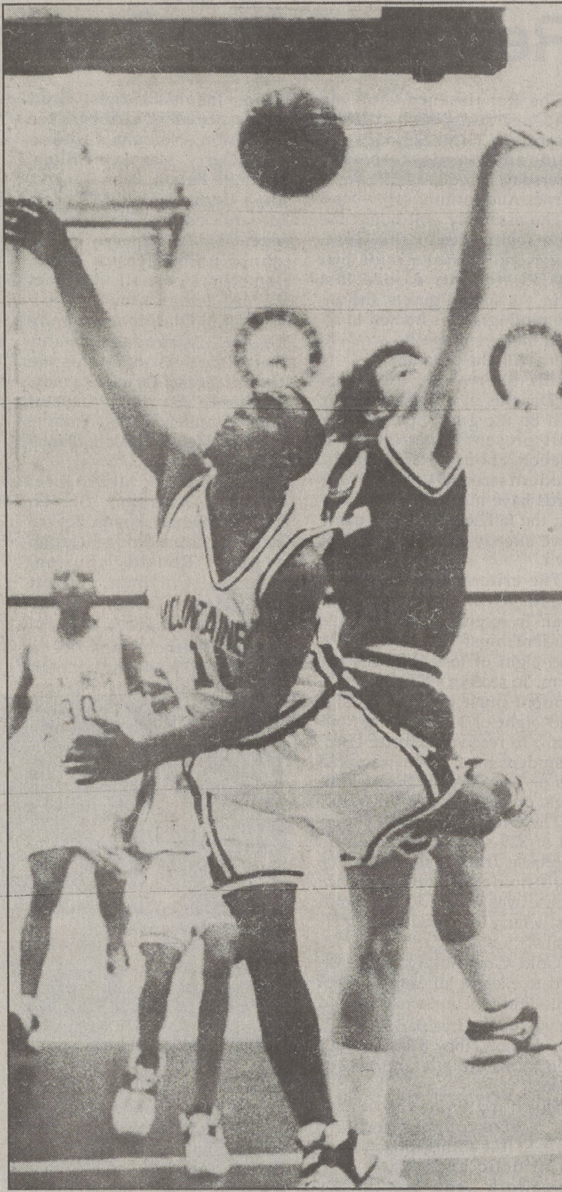
North Gaston. The Mounties host East Rutherford in their final regular season game Friday night at home. The winner will earn a share of the Southwestern 3-A Conference championship and the loser will drop into a tie for third place.