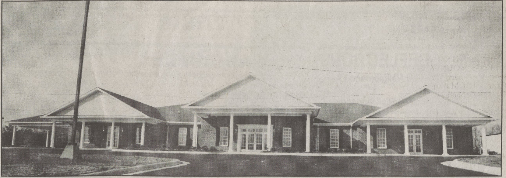
New Cleveland Funeral Services building contains 16,100 square feet of space