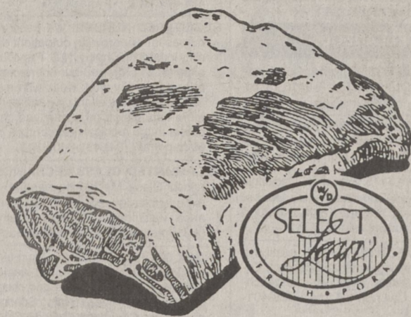
W-D Select Lean Fresh