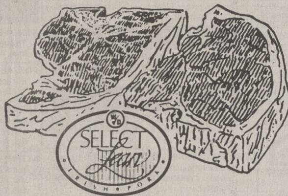
W-D Select Lean Fresh Full Fifth Loin