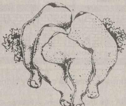
10 lb. bag U.S.D.A. Inspected Fryer