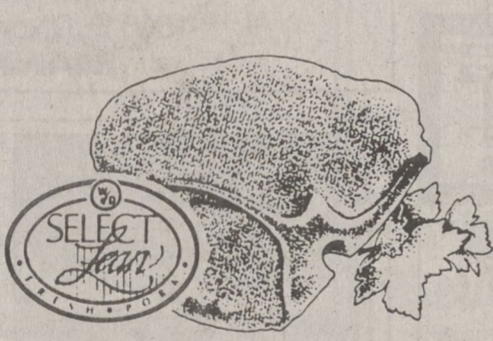
W-D Select Lean Fresh Center Cut Loin