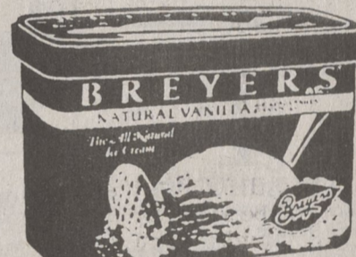
half gallon Breyer's All Flavors Except Soft & Creamy