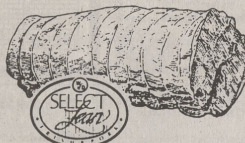
W-D Select Lean Fresh Whole Center Cut Boneless