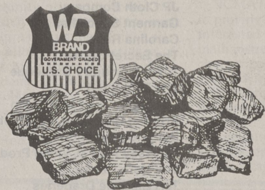
W-D Brand U.S.D.A. Choice Lean Boneless