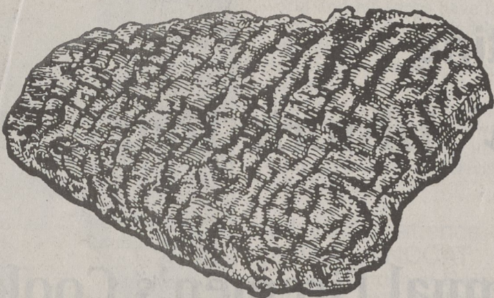
W-D Brand Family Pack

Our lowest price to everyone... Everytime you shop! You don't need a card.