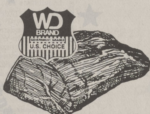
W-D Brand U.S.D.A. Choice Whole Cry-O-Vac