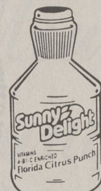
64 oz. bottle Citrus Punch or California Style