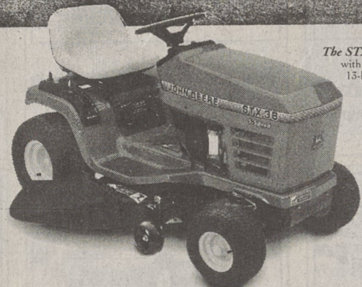
The STX38 5-Speed Lawn Tractor with 38-inch cutting width and 13-hp overhead-valve engine.