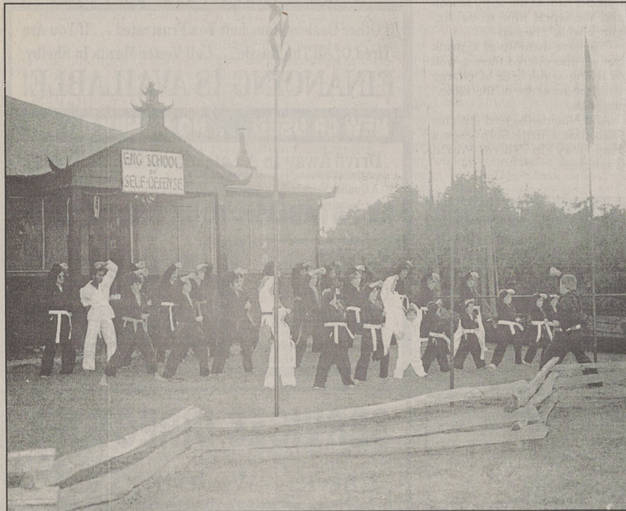
Eng School 20 years ago on East Gold

To celebrate its 20th anniversary, The Eng School is running a "Back to the 70's" anniversary special throughout the month of June. Call 739-1872 for details.