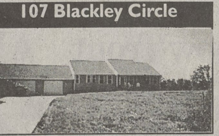
107 Blackley Circle

Wildwood Pines Winner! - Like new 3 bedroom, 2.5 bath home with custom cabinets, vaulted ceiling, hardwood floors and much more! Hwy 198 to Earl, cross railroad to Bettis Rd., 1 mile to Wildwood Pines, Bankhead Rd. to Blackley Circle. Joyce Dixon. (21832/4502)