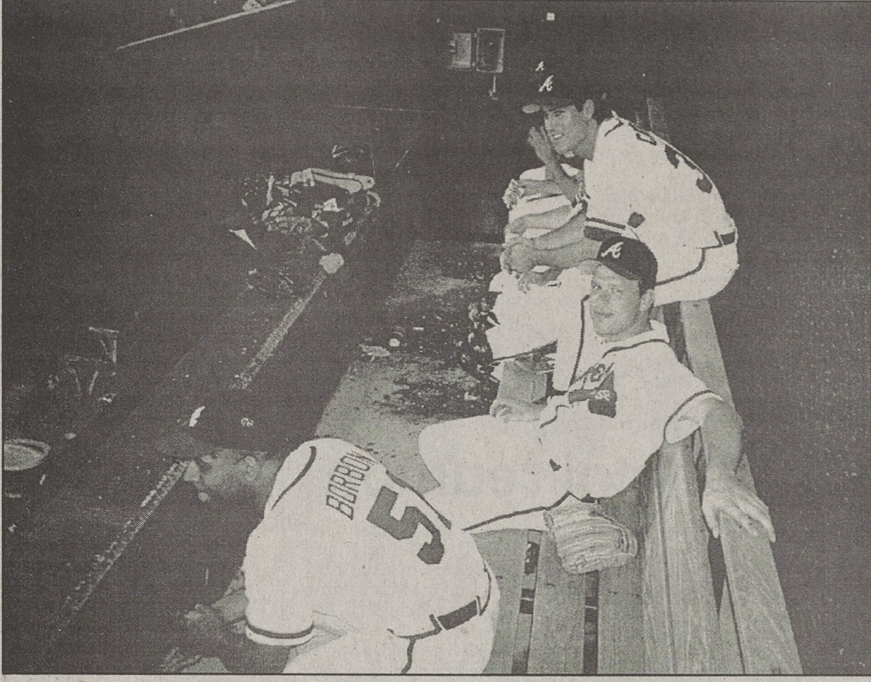
IN THE BIG LEAGUES - Bessemer City pitcher Kevin Millwood sits in the Atlanta Braves bullpen during Sunday night's game with the Philadelphia Phillies at Turner Field. Millwood made his major league pitching debut with the Braves Monday night, going two innings in relief and getting the win in a 10-6 win over the Phillies.