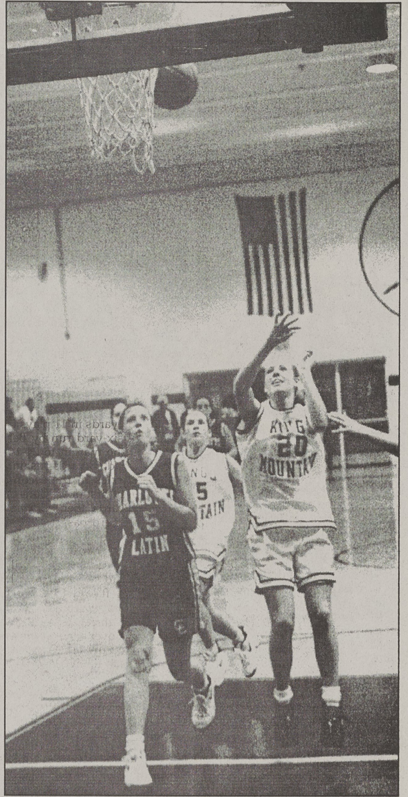
games with Charlotte Latin at the KMHS gym. The Mountaineers host Clover, SC tonight.