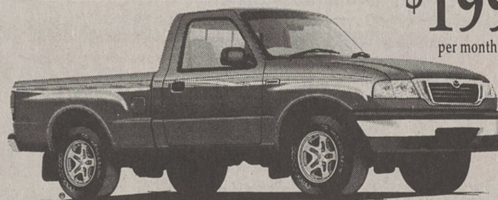
1998 MAZDA B2500