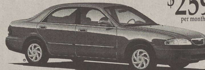
1998 MAZDA 626