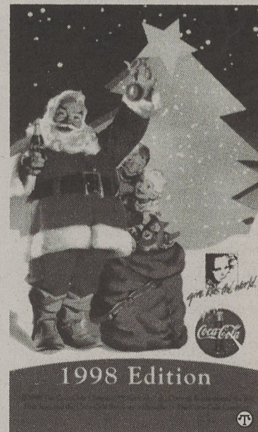
Less than two dollars can buy small miracles and big bargains.

Give Kids the World holiday discount card are expected to exceed $2 million, making it the largest single donation ever received by Give Kids the World.