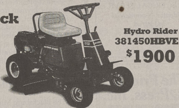
Hydro Rider 381450HBVE $1900

You're at that age where responsibility sometimes edges out desire. But with Snapper's new hydrostatic drive rider, you can have both. This mower helps you get the job done in style. No shifting, just step on the pedal and go. Plus you get all the durability and craftsmanship that you expect from a Snapper. Don't forget to ask your dealer about Snap-Credit™.