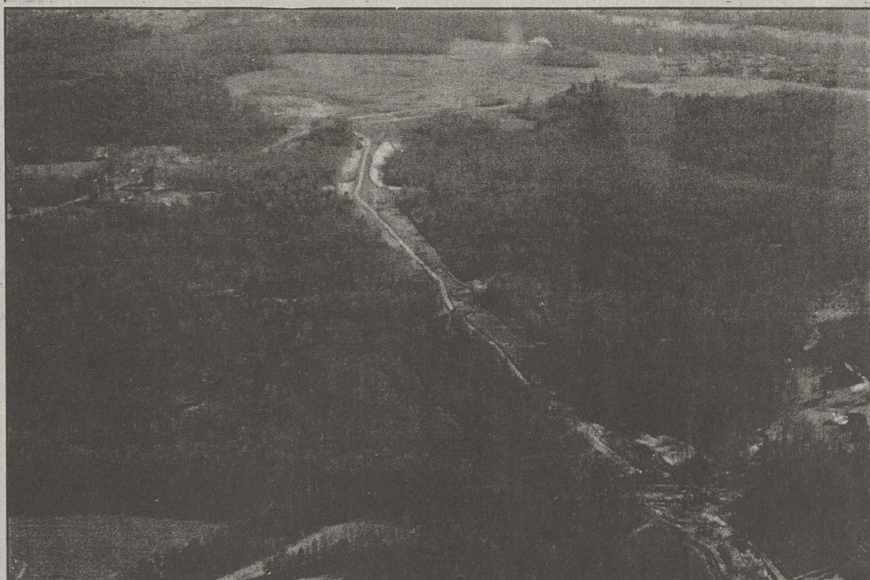
Work under way on Dixon Road extension to Highway 74