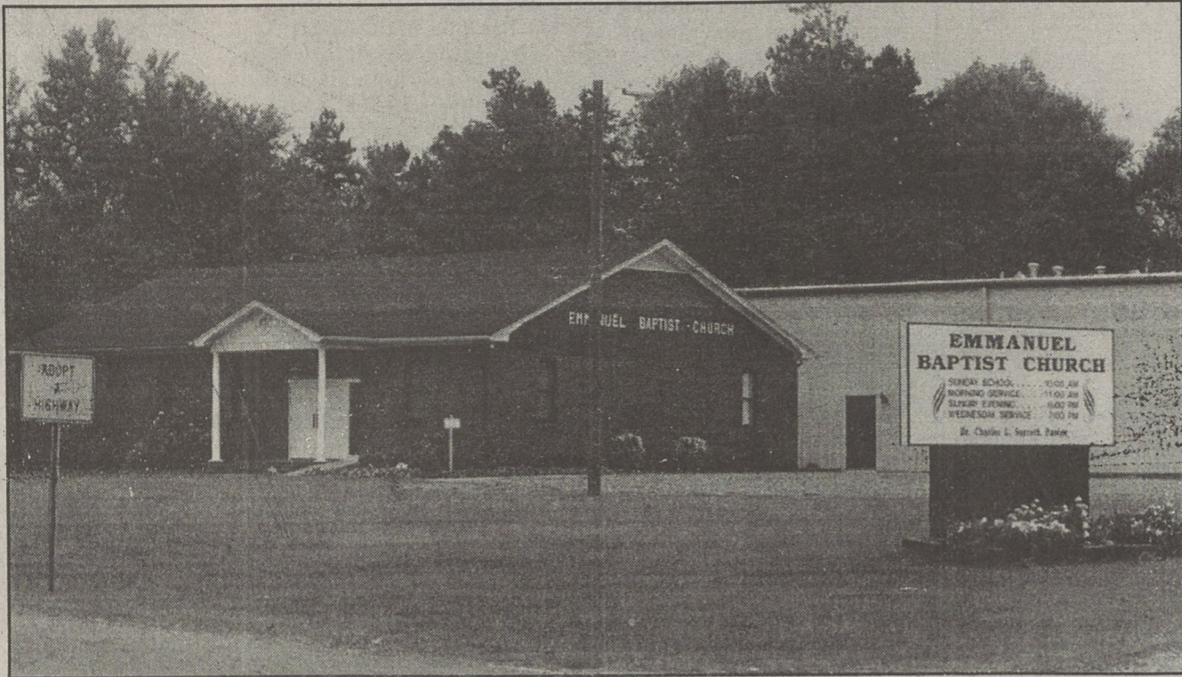
Emmanuel Independent Baptist Church ~ 602 Canterbury Road ~ Kings Mountain