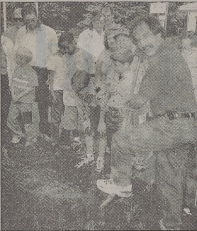
After much digging with a pick and shovel failed to uncover the time capsule buried under the lawn at Mauney Memorial Library in Kings Mountain, a backhoe was brought in to finish the job.