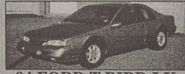
94 FORD T-BIRD LX S# 9225A. V6, Automatic, PW, PDL, Tilt, Cruise, Sun Roof, Extra Clean, Must See! $6,910