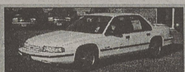
93 LUMINA EURO S# 9483A. 4 Dr. PW, PDL, Tilt, Cruise, AM/FM Cass., Alum. Wheels, A/C, Very Clean. $4,937