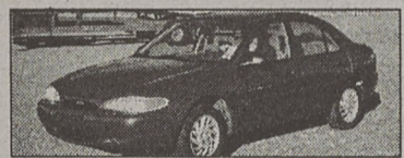
97 FORD ESCORT LX S# 9774A. Maroon, 4 Dr. Auto, Alloy Wheels, Remote Entry, Cruise, Tilt, Dual Air Bags, A/C, AM/FM Cass., PM, Only 38,800 Miles, Super Nice! $6,988