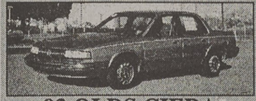
93 OLDS CIERA S# 9178A. Tilt, Cruise, PW, PDL, V6, Rear Defroster, Great For Economy & Comfort. $5,972