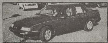
95 CHEVY CORSICA S# 9775B. Auto, Tilt, Cruise, PW, PDL, AM/FM, Luggage Rack, Great Local Car. $4,345