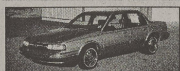
94 OLDS CIERA S# 9863A. V6, Automatic, Tilt, Cruise, PW, PDL, Only 46,000 Miles. $5,540