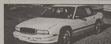
93 BUICK REGAL CUSTOM S# 9568A. V6, Auto, All Power Buttons, Locally Owned. $5,939

Great Selection! Low Prices! HIGH CUSTOMER SATISFACTION!