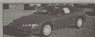
93 EAGLE TALON ES S# 9642B. 5 Speed, PW, PDL, AM/FM Cass., A/C, Local Trade. $5,640