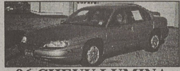
96 CHEVY LUMINA S# 9784A. PW, PDL, Tilt, Cruise, V6, AM/FM Cassette, Dependable! $7,376