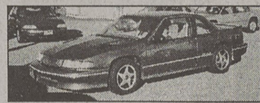
94 CHEVY LUMINA Z34 S# 9117A. Totally Loaded With All Options, Great Sports Car! $6,780