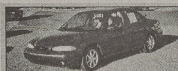
95 FORD CONTOUR SE S# 9868A. PW, PDL, Tilt, Cruise, Sun Roof, Auto, Much, Much More! $6,967