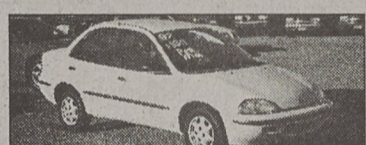
97 GEO METRO LSI 4 Door, Automatic, Air Conditioning, 36,700 miles. $8,988