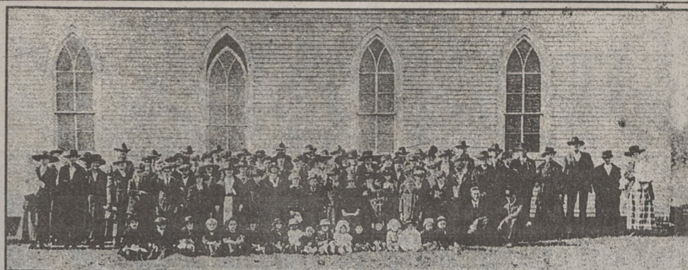
Original church members

Grace United Methodist's 100th anniversary Sunday will feature 1900 worship service