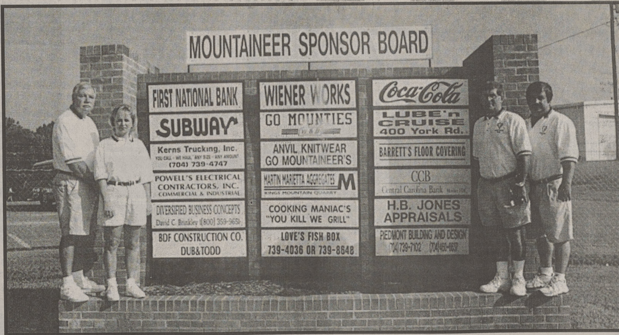
Pictured above is the "Mountain Sponsor Board" at John Gamble stadium.

The Kings Mountain High School Booster Club is excited again this year to offer what we feel is an attractive way to advertise your business as well as show your support for Kings Mountain High School athletics.