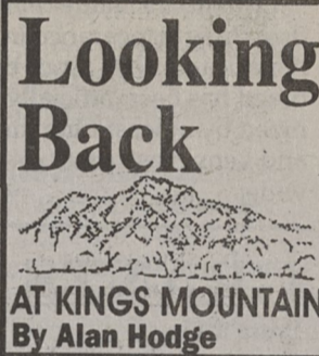
AT KINGS MOUNTAIN By Alan Hodge