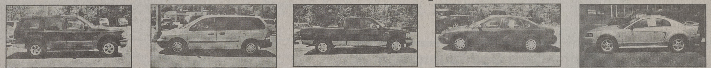
1997 Ford Explorer 4x4 2000 Ford Windstar 2000 F-150 SuperCab 1999 Ford Taurus SE 2000 Ford Mustang V-6

Why Drive an Older Used Car When You Could Drive A Nearly New Car or Truck!