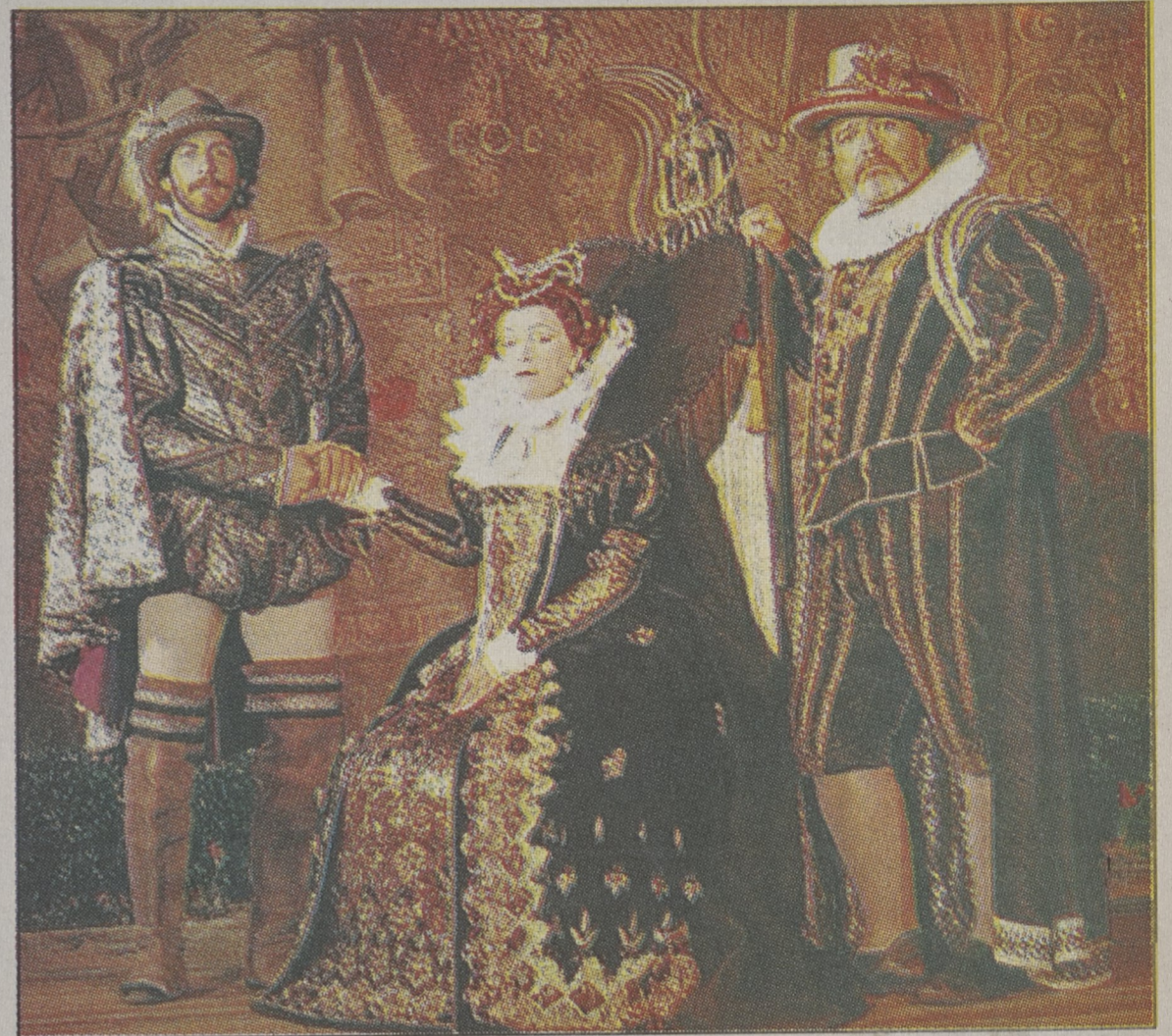
"The Lost Colony", Outdoor drama, Manteo

Most performances for the Eastern Music Festival will be held at Dana Auditorium on the campus of Guilford College. Times are 8 p.m. Monday through Saturday. The toll free box office number is 1-877-833-6753. All concerts require a ticket and advance purchase is recommended. Rounding out this tour of