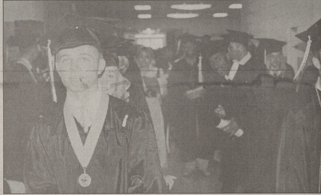
Kings Mountain High School graduates line up before heading toward Gamble Stadium Friday.