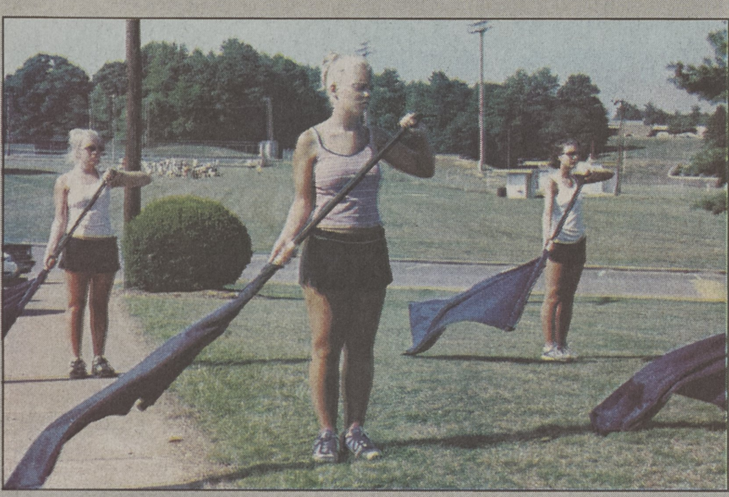
Members of the Kings Mountain High School flag squad practice recently at the school.