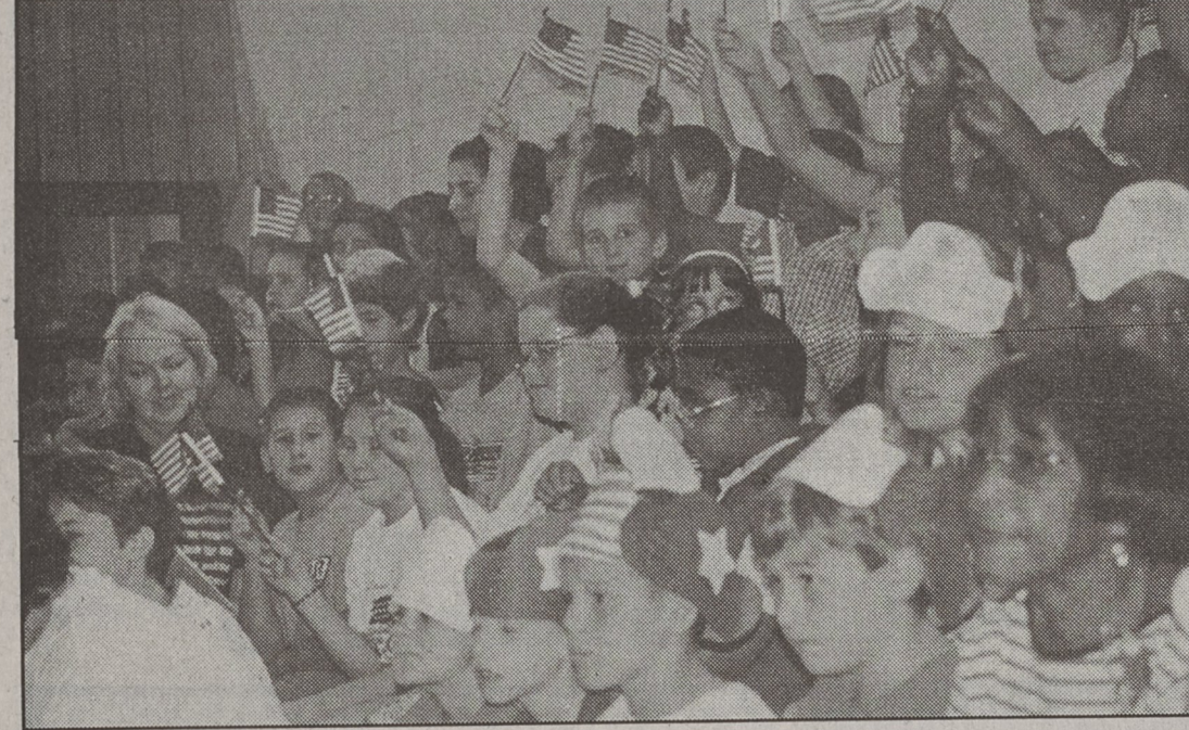
BEN LEDBETTER / THE HERALD

The following deadlines apply for news items. Deadline for B Section news is 12 noon Monday. This includes lifestyles news, people stories, weddings, engagements, anniversaries, reunions, club news, church news, business news, school news and community news. Items received past the deadline will run in other parts of the paper if time and space permit. Otherwise, they will be held until the following week.