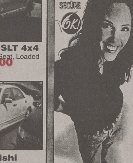
2001 Mitsubishi Diamante