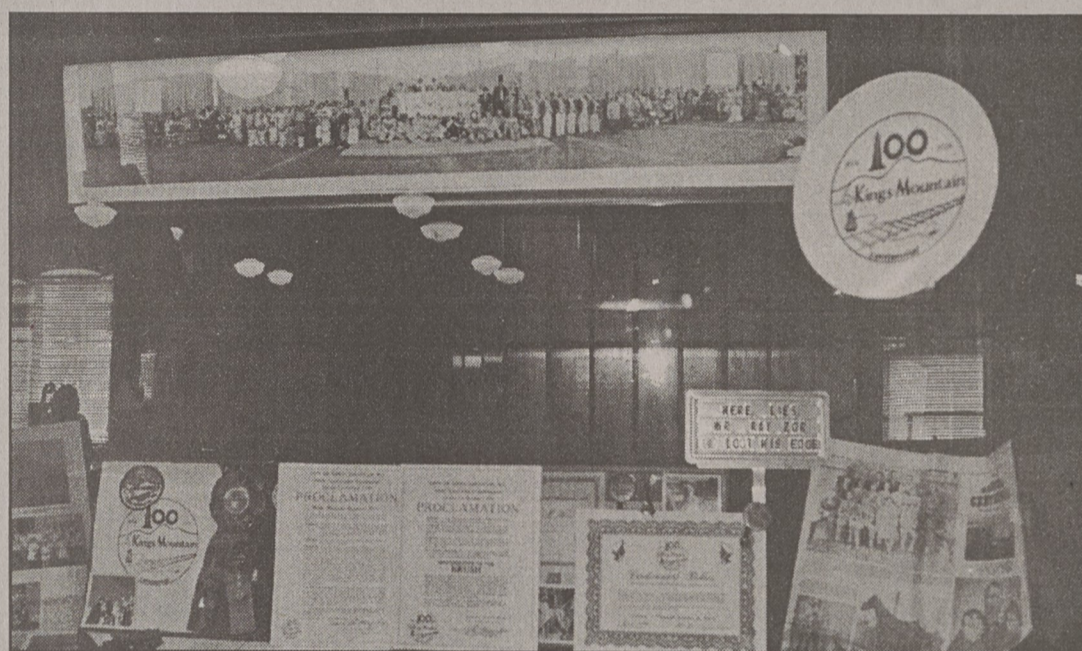
Memorabilia from Kings Mountain's centennial celebration is on display at the Kings Mountain Historical Museum