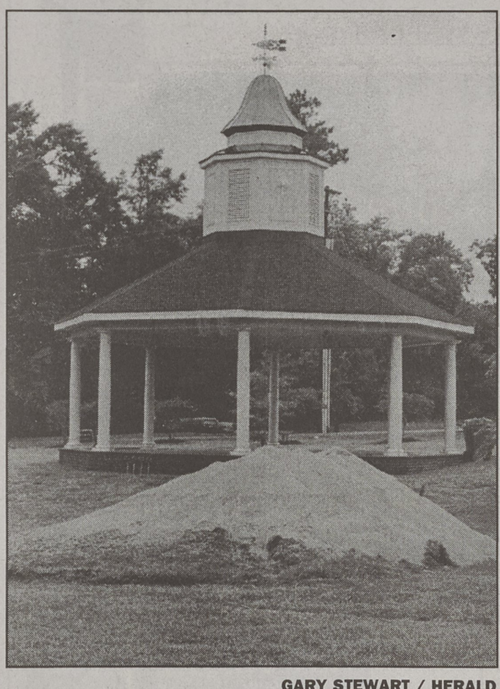
DESERTED BEACH - Only the cameraman made it to the scheduled Beach Blast Saturday at Patriots Park. Because of heavy rains the event was postponed until Saturday, July 26.

Select Summer Apparel & Shoes A 30% off Hurry in for best selection! Sale starts June 9.