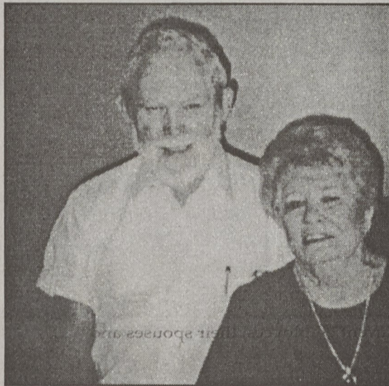
MR. AND MRS. BURNS NOW

The next day, they'll all watch a video of the prom on a big screen television rented just for the week. The television will also be used during a movie night.