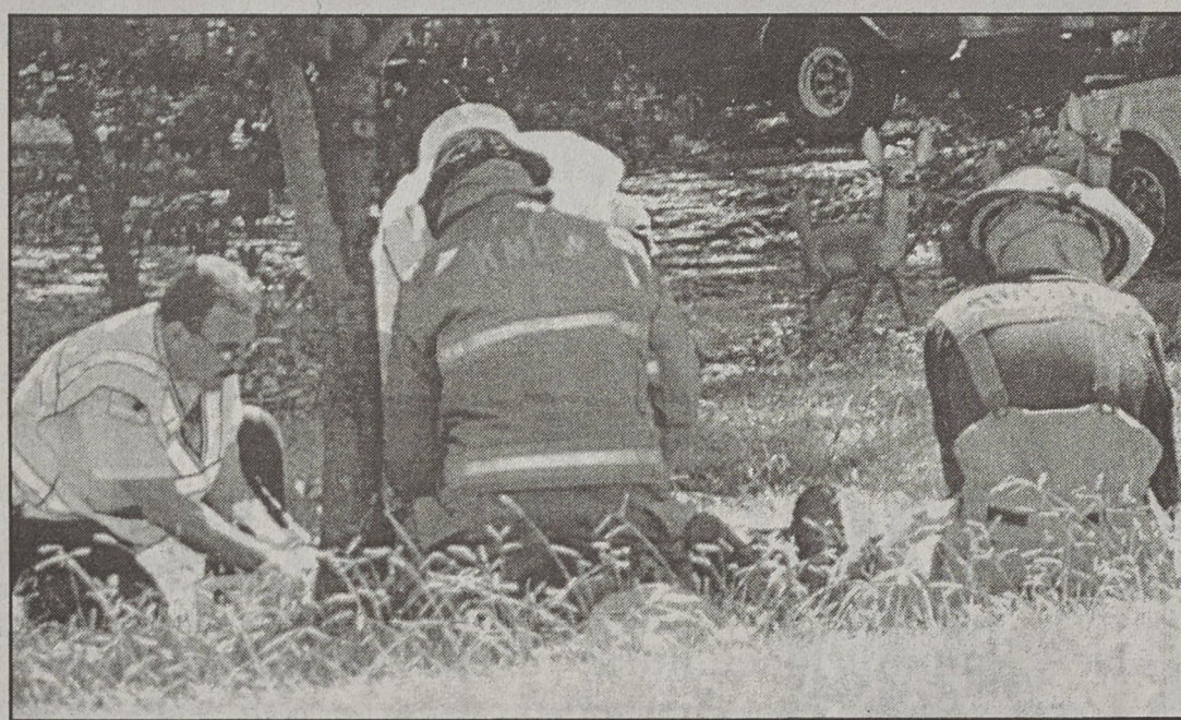
Local emergency workers help an injured passenger following wreck on Highway 216 Monday

Searcy of Marion and Mary Moore of Gastonia struck on I-85 at US 74 East. Damage to the Searcy vehicle was $3,000 and damage to the Moore vehicle was $5,000. Searcy was cited for an unsafe movement.