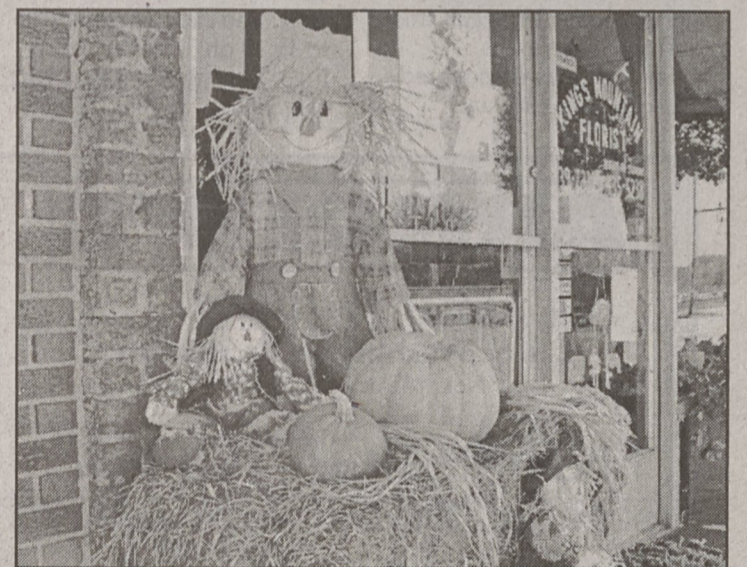
Kings Mountain Florist is among one of many downtown merchants creating autumnal displays to celebrate the season.