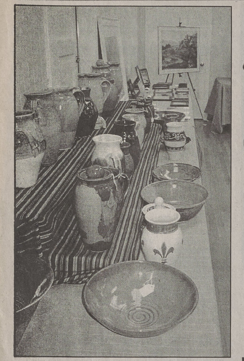
Art on display at Southern Arts Society's new home, the former Kings Mountain depot.