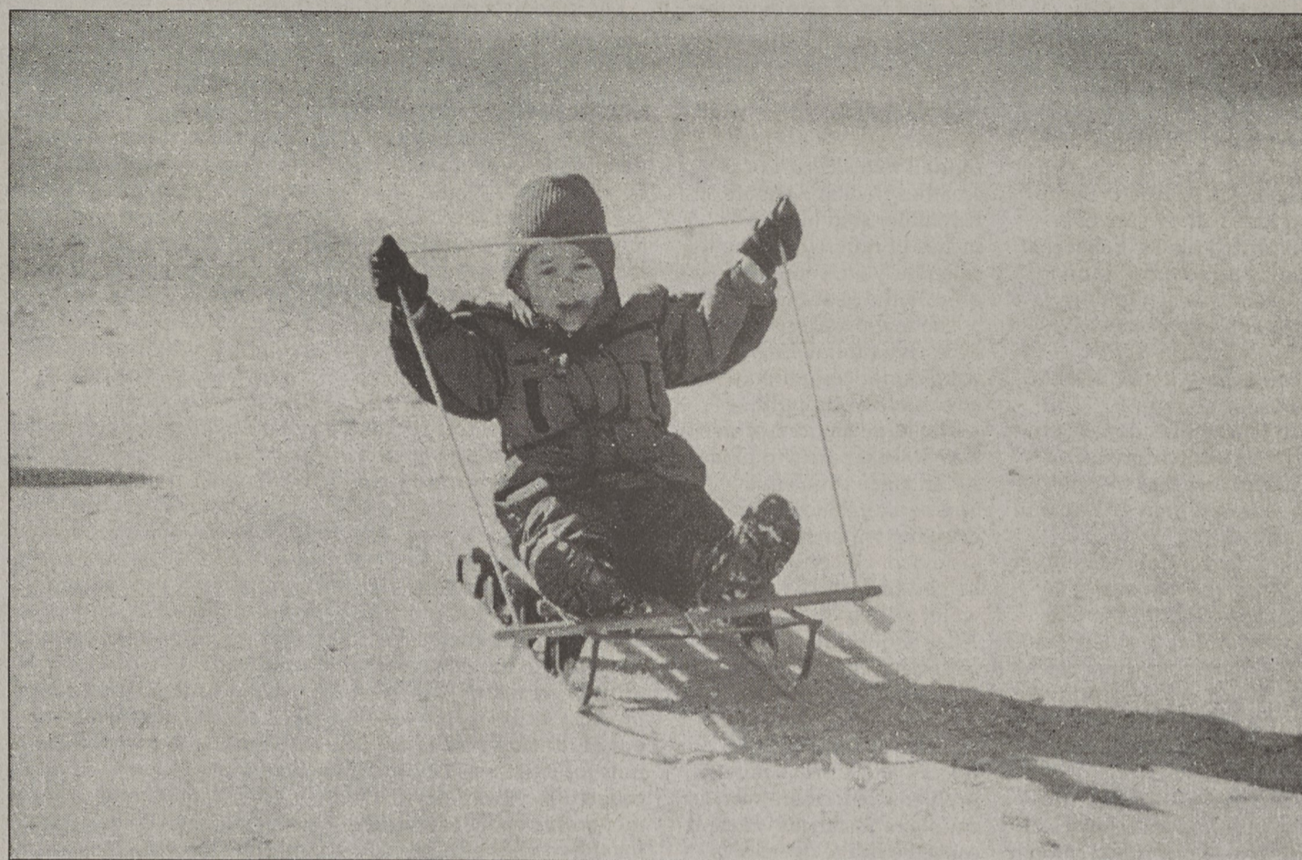
The weather may be unseasonably warm this week, but what will the next few weeks hold? Last January 21, Kings Mountain received a six and one-half inch snow which made life fun for the kids like the one above, but was a headache for local residents who had pipes to freeze during several straight days of sub-freezing temperature.