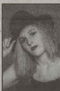
Teen Charlotte pageant on