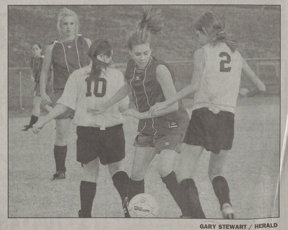
Kings Mountain (light jerseys) and Hickory players battle for control of ball in JV soccer match Monday at John Gamble Stadium. Hickory won 3-0.

108 E. Grover Street • Shelby (One block west of the hospital)