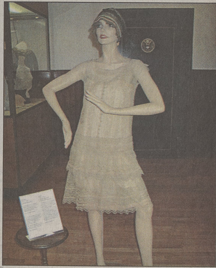
The hand embroidered buttons on this flapper dress appeared to be in motion as the wearer danced the Charleston.

The exhibit is free and runs through June 11. Museum hours are 10 a.m. to 3 p.m. Tuesday through Saturday. The museum is also open on the second and fourth Saturdays from 10 a.m. to 3 p.m. during exhibits.