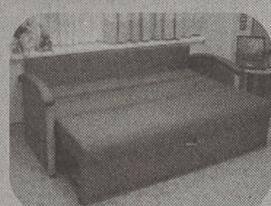
The sofa is easily converted into a full-size double bed.

As brilliant as architects are, we would never ask one to deliver a baby. So we understand why doctors may not be asked for input when it comes to designing a building. This time was different. See, when we set out to construct our new Birthplace, we wanted to create an environment that supports our philosophy of family-centered care. So we asked for input from our families,